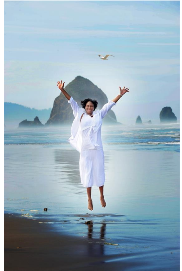
Cannon Beach, Oregon